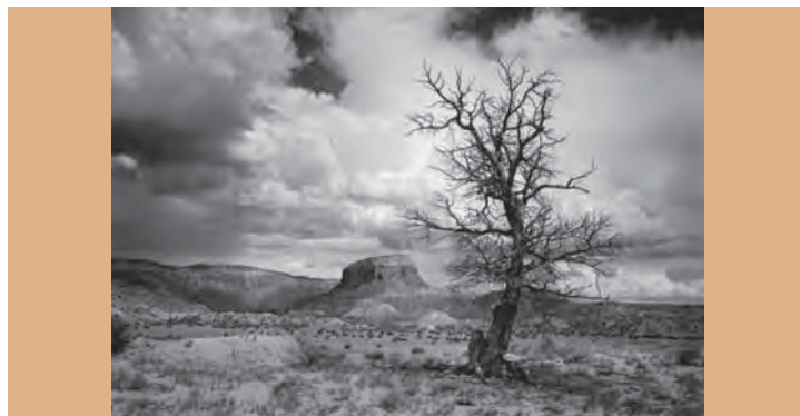
Black tree and Orphan Mesa, 2005.