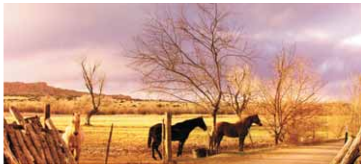
"PERFECT PASTURE" BY MICHELLE STUMP.

To show me what she's talking about, Michelle had me drive five miles per hour down a dirt road in El Rancho past quaint old estate walls, quirky artistic neighborhoods, the perfect view of Black Mesa, and the trickle of the Rio Grande that keeps the rose bushes lush.